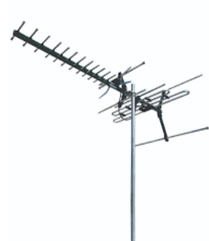
World Satellite TV Systems.

Are you looking to broaden your image?? Want to have your voice heard in our community? Why not join the PBA-FM family by sponsorship. It is a wonderful way to get your message out not only to more people but a diverse tuned-in audience. We have everything from classic to hard rock and everything in-between, and shows that highlight special people and events. There is something for everyone. You can become a station sponsor or maybe there is a particular show that you think would fit with your business.