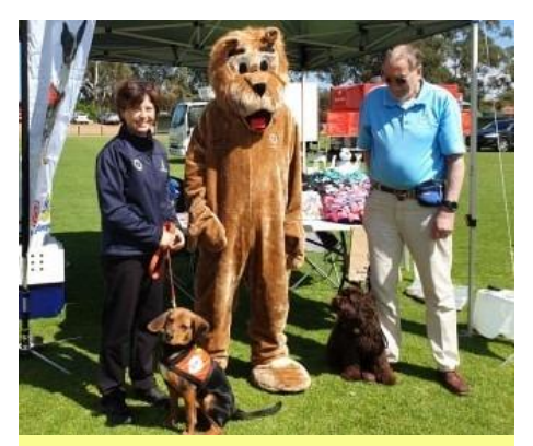
And the Lions Club animal companion dogs' marquee was just super sweet, so wanted to add this to our pics of the day.

Hope to see you at our next Outside Broadcast.