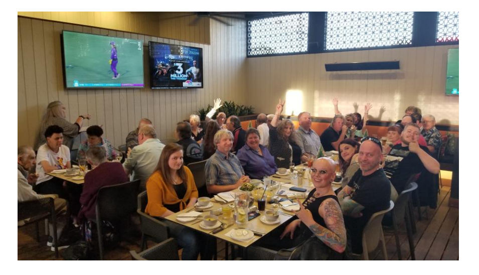
Instead our web designers have made us a special page to view all the wonderful photos from the night. Just click below.